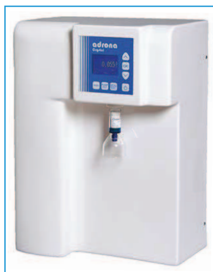
Pictures are for reference only. Depending on configuration, some options may not be present