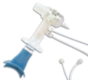
On-Line NO Breath Kit